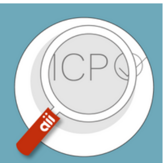
Building capacities through the The ICP Self-Assessment Tool, the level of observance of the Insurance Core Principles