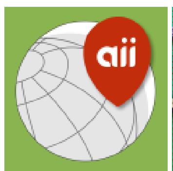
Regulations Map: Inclusive Insurance regulation in the world