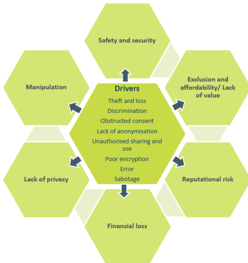
Figure 1: Key risks and primary drivers

Six core risks to consumers. Figure 1, below, provides a simplified snapshot of the major risks that may arise from insurers’ use of consumer data and of the primary drivers of these risks.